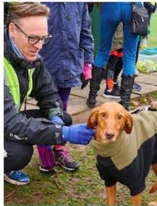
No dogs allowed