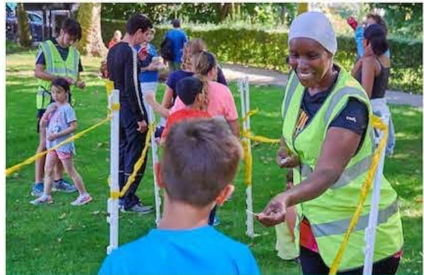
Only children to enter the finish funnel