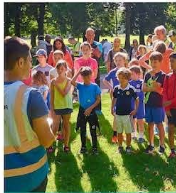
Please pay attention to the pre-run briefing