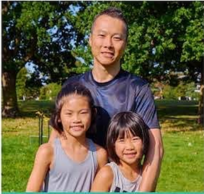
A parent or guardian accompanies under 11s to and from the event