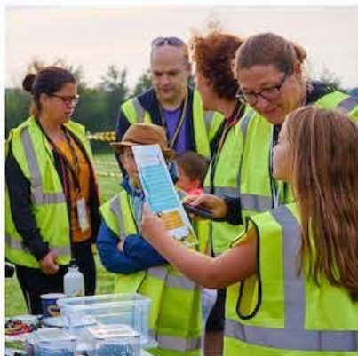
Thank the amazing volunteers!