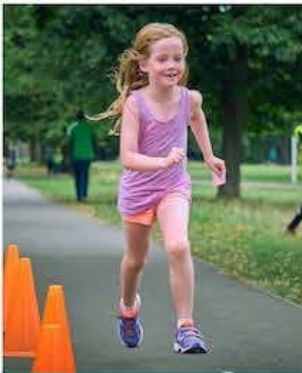
Let children walk, jog, hop, skip and run for fun!