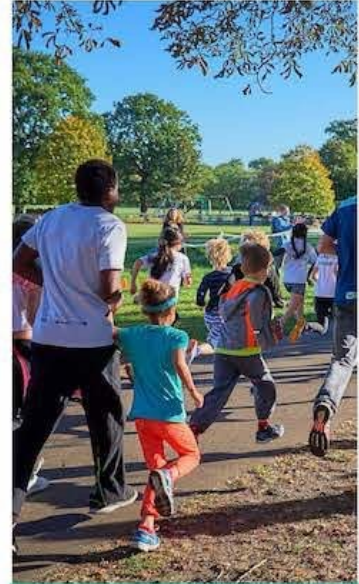
Respect the park and other park users