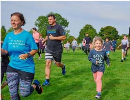
Parents and guardians can take part too