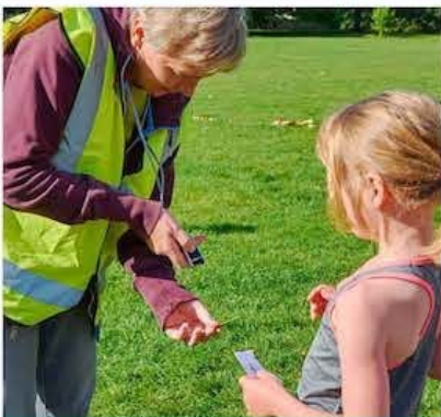
No barcode, no time, no exception