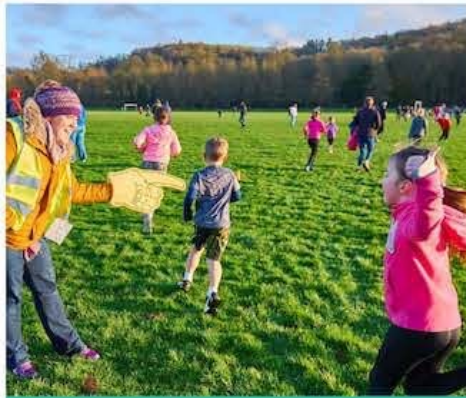
For children aged 4 to 14